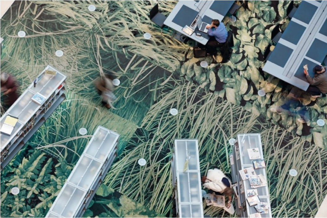
Inside Outside Seattle Public Library @IBaan