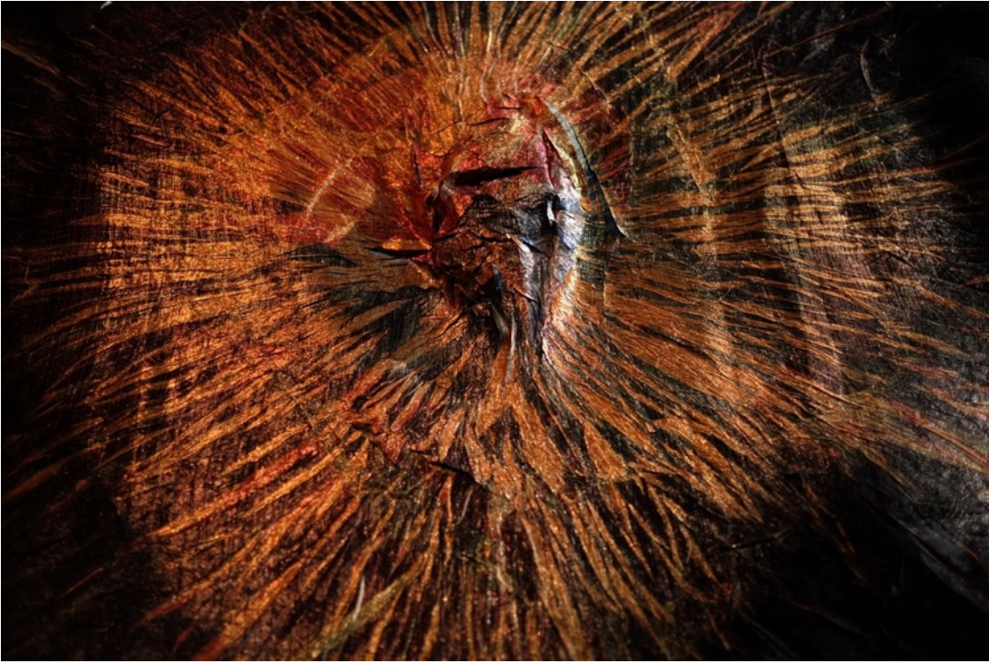
Junichi Arai, Kaleidoscope , 1992 Polyester, aluminium (silt-yarn), 103 x 119 cm