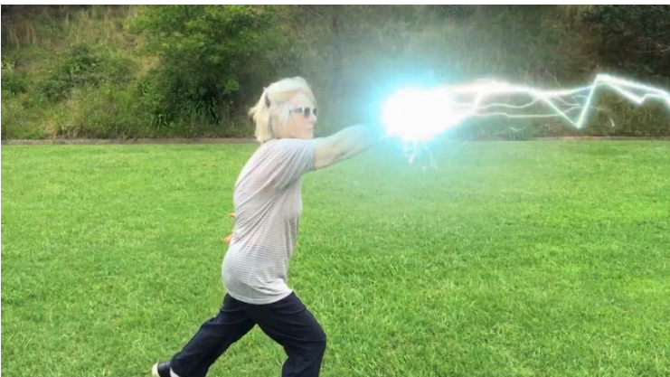
Tina Havelock Stevens, I Don't Want to Set the World on Fire , 2016